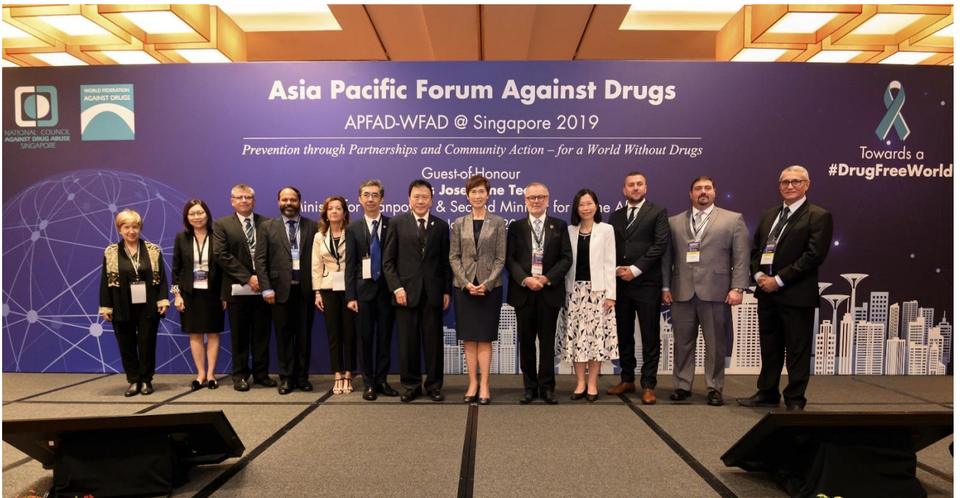
Photo 3: Asia Pacific Forum Against Drugs (APFAD-WFAD @ Singapore 2019) Guest-of-Honour Mrs Josephine Teo, Minister for Manpower and Second Minister for Home Affairs, with representatives of the National Council Against Drug Abuse, World Federation Against Drugs, Director Central Narcotics Bureau, Deputy Commissioner (Policy & Transformation) of Prisons, and this year's forum speakers.